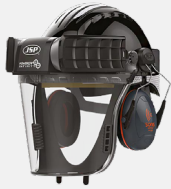
Multi-tasking, lightweight headwear