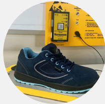
Women's fit safety shoes