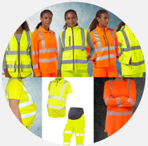
Women's hi vis ranges

We're glad to announce there's extensive ranges of Women's fit workwear & PPE available, alongside modesty and maternity options.