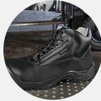
Lightweight & flexible safety footwear